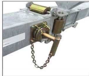
MEGA-ROLLER™ W/ SECURELOCK™ SYSTEM (PATENT PENDING)